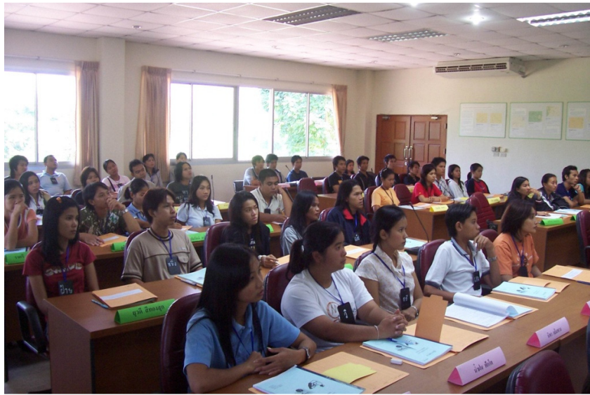
Interviewers undergoing training at the Kanchanaburi Field Station.