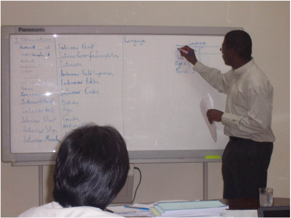
A database expert from South Africa working with the Kachanaburi DSS team